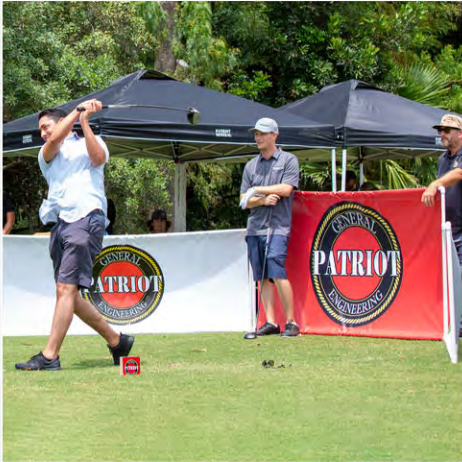
PGA TOUR STYLE TEE BOX