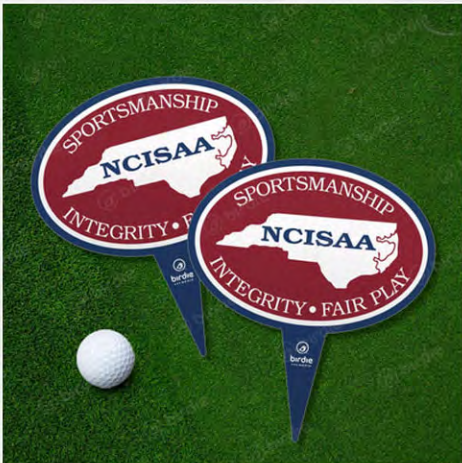
TEE BOX MARKERS