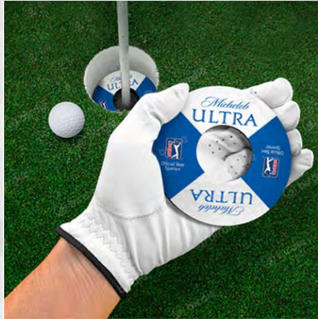
"IN THE HOLE"