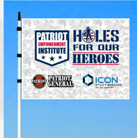
LOGO ON PIN FLAGS